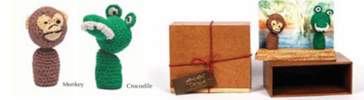
Ke Ki Ka Finger Puppets

Material : Wool Finish : Dyed Size (mm) : L 40X W 40X H 65