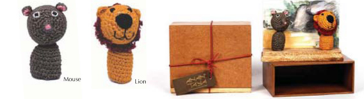
Ke Ki Ka Finger Puppets

Material : Wool Finish : Dyed Size (mm) : L 35X W 35X H 60